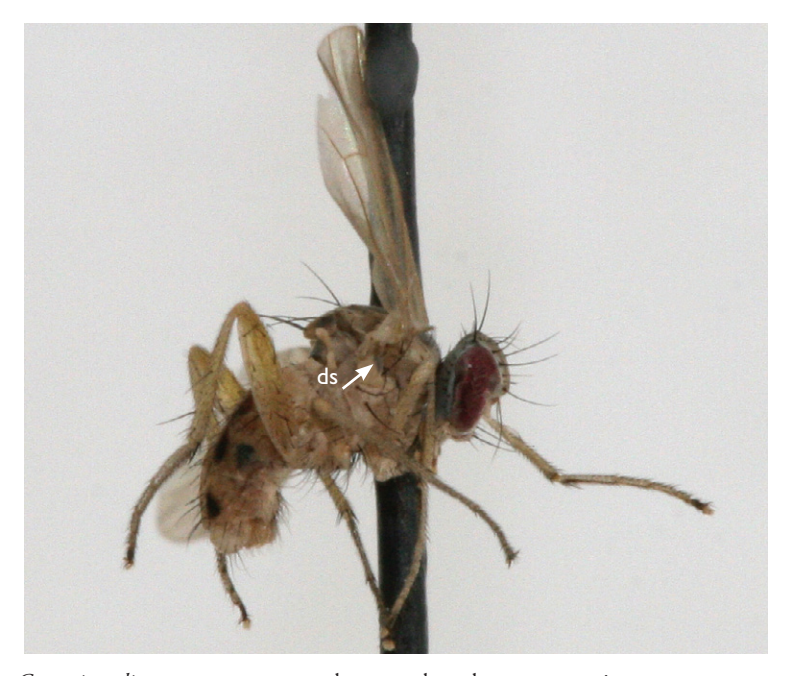
Figure 1. Coenosia polina sp. n. – paratype; ds – grey dusted spot on anepimeron.

Thorax. Entirely yellow, only central part of dorsum of scutum grey dusted and anterior part of an epimeron with a small grey dusted subtriangular spot (Fig 1.). Dusted area on scutum restricted within the lines between presutural and intraalar setae; post-