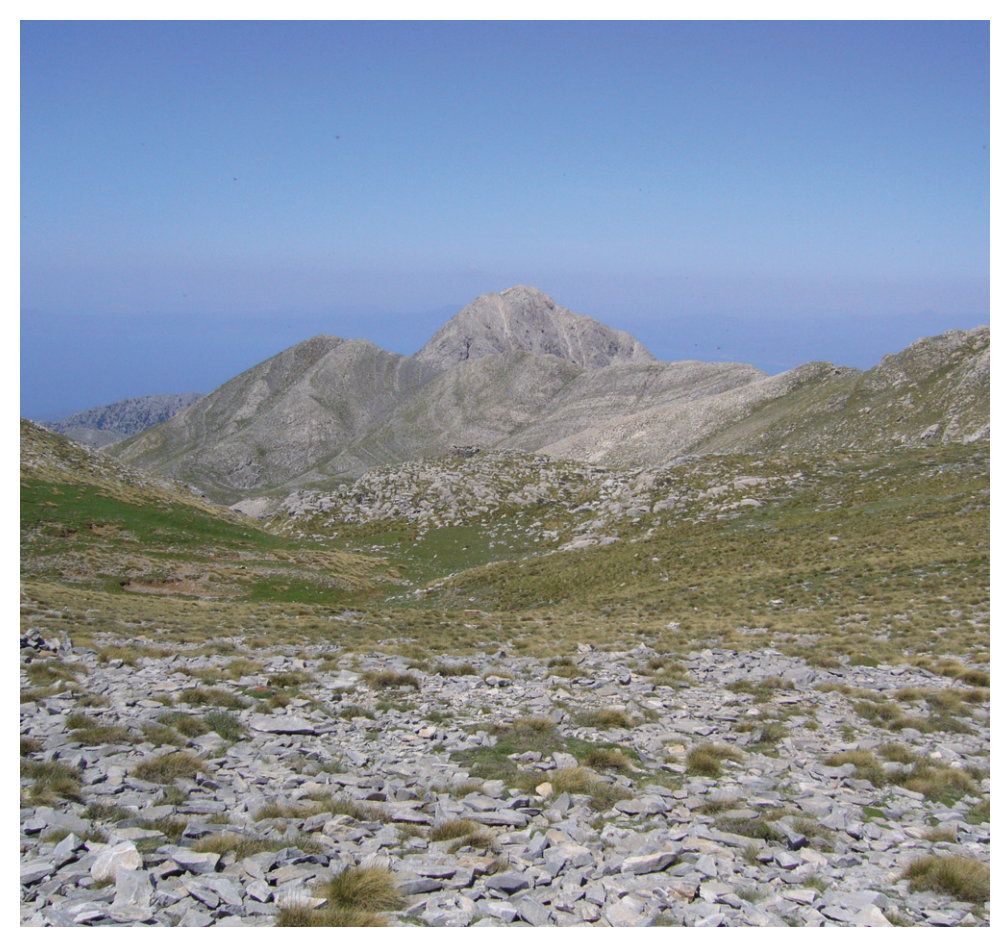
Fig. 3. Habitat of Philorhizus marggii n. sp.

with small body size suggest that these taxa survived the glacial periods within or close to the recent/present-day distribution areas (cf. Holdhaus 1954). Moreover, we believe that these endemic Philorhizus species are relicts because in many cases not only one, but several massifs are colonized (cf. Habel and Assmann 2008). In contrast to some extreme endemics, such as numerous Trechus species or cave dwelling carabids, it is highly probable that these Philorhizus species had a wider distribution in the past. Otherwise it is difficult to explain the existence of some isolated populations of the same species such as Ph. dacicus Sciaky, 1991 known from Romania and Ukraine (Kabak 2003), Ph. brandmayri Sciaky, 1991 recorded from Sicily and the Aspromonte Mountains in Calabria and Ph. paulo Wrase, 1995 distributed in northern Spain and the Pyrenees. A new record from a locality in the East Pyrenees, about 5 kilometres southwest from Prades-de-Mollo-la-Preste, close to the Spanish border, enlarges the known distribution area of Ph. paulo to southern France (first record for France: "France, Collado de Ares, 27.V.1978, Hozman lgt." (Dept. Pyrénnées-Orientales); 1 male in cWR).