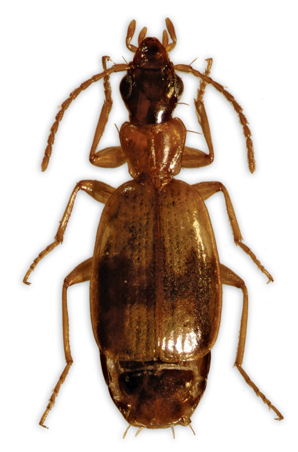
Fig. I. Philorhizus marggii n. sp., habitus, holotype.