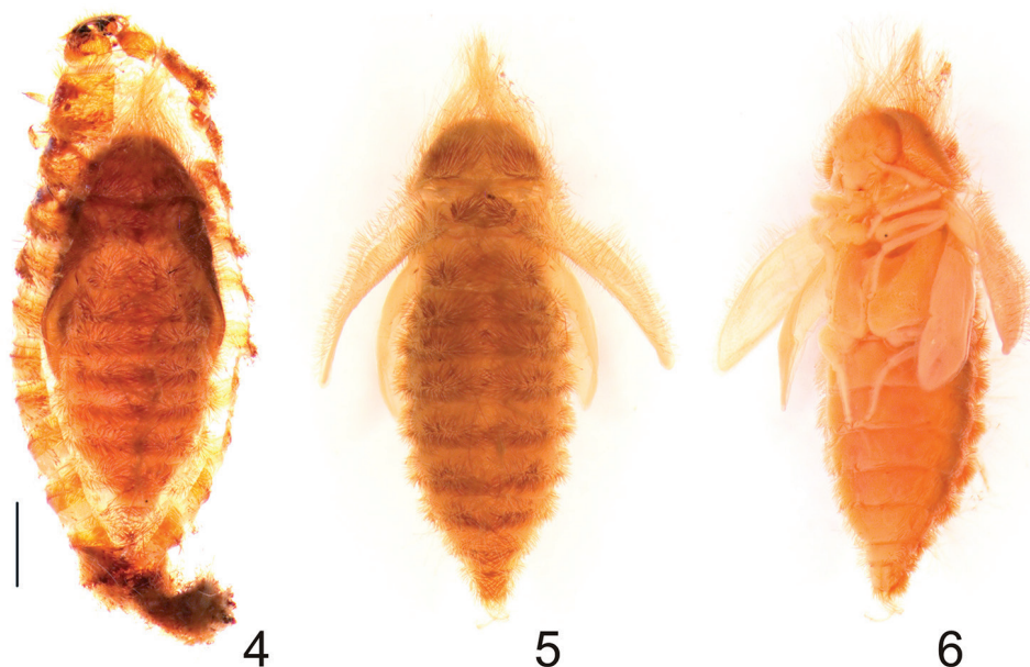
Figures 4–6. Pupa of Megatoma (s. str.) undata (Linnaeus, 1758). 4 Dorsal view (pupa inside of the last larval skin) 5 Dorsal view 6 Latero-ventral view. Scale bar 0.1 mm.