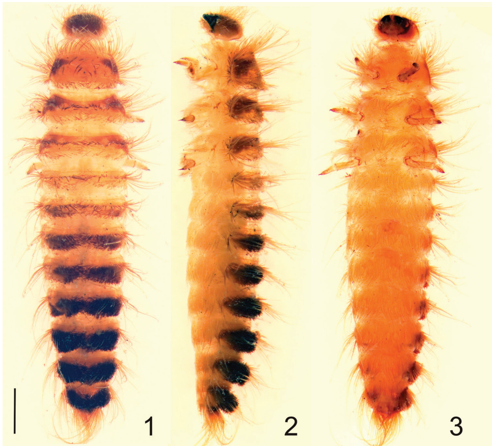
Figures 1–3. Mature larva of Megatoma (s. str.) undata (Linnaeus, 1758). 1 Dorsal view 2 Lateral view 3 Ventral view. Scale bar 0.1 mm.

middle on terga II and III. Setae (spicisetae and hastisetae) on tegra and sterna brown (Figs 1–3). Head of hastisetae short; 3–4 times long as wide (Fig. 8). Head protracted and hypognathous (Figs 2, 3). Stemmata (probably 5) present on the head, arranged in two semi-oblique rows. Frons triangular (Fig. 9), without frontal, median tubercule; covered with spicisetae and nudisetae (the latter present only at the anterolateral angles of the frons); setal patterns as on Fig. 9. Antennae orientated anterolaterally (Fig. 1); composed of three antennomeres (Fig. 7). Terminal antennomere 3.0 times as long as wide, with two small sensory sensilla (appendages): one on the apex, second one under the apex; and two campaniform sensillae under half of length of antennomere (near base). Ratio of length of terminal antennomere to length of penultimate and antepenultimate antennomeres combined nearly 0.4:1.0. Sensorium in ventral position, below the apex of antennomere II. Single seta present on antennomere II near apex (opposite to sensorium). Three campaniform sensillae present on antennomere II – two under sensorium and one close to the base of the segment. Antennomere I