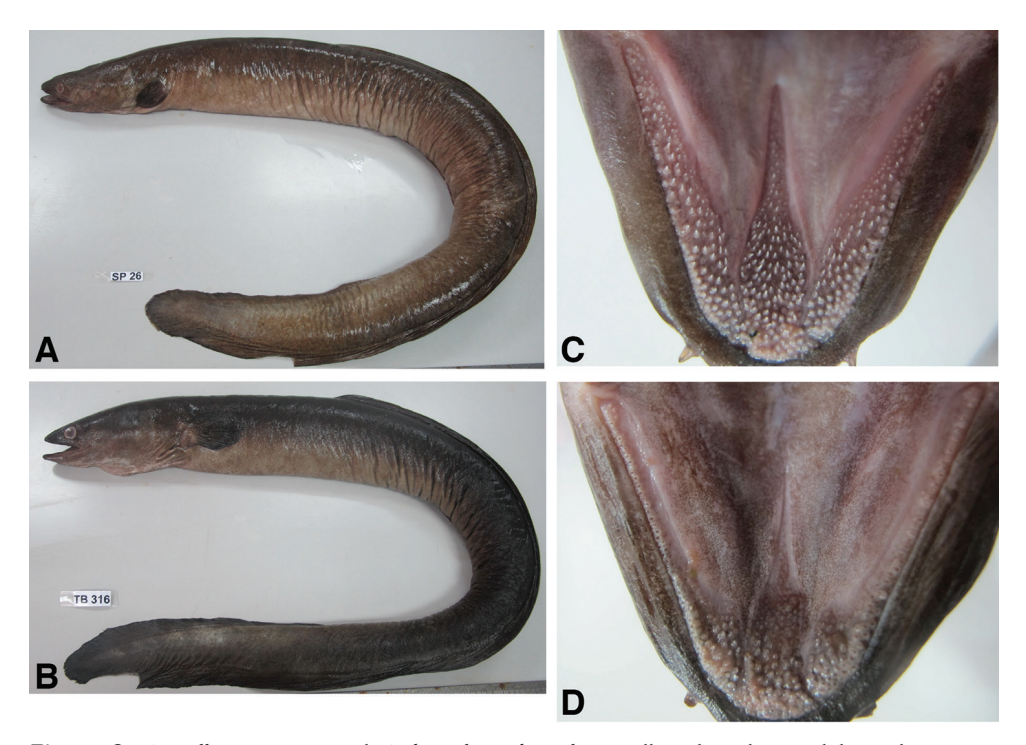
Figure 2. Anguilla marmorata and A. bengalensis bengalensis collected in the Pondok Upeh River in Penang Island of Peninsular Malaysia. A Anguilla marmorata (904 mm in TL) B Anguilla bengalensis bengalensis (889 mm in TL) C Wide maxillary bands of teeth of A. marmorata D Narrow maxillary bands of teeth of A. bengalensis bengalensis. DNA was extracted from dorsal fin clip of each specimen, and hence the posterior dorsal fin of each specimen is lacking.

The geographical distribution of anguillids is used in combination with key morphological characteristics to determine the classification of each species into four groups. Within the first group, A. interioris, A. megastoma, A. luzonensis exist in New Guinea, Solomon Islands, New Caledonia, Fiji Islands, Cook Islands, and northern Philippines (Ege 1939). Therefore, SP26 was considered to be A. celebesensis with a range of FDI from 6 to 12 and of NMM from 4 to 9 (Ege 1939, Watanabe et al. 2004).