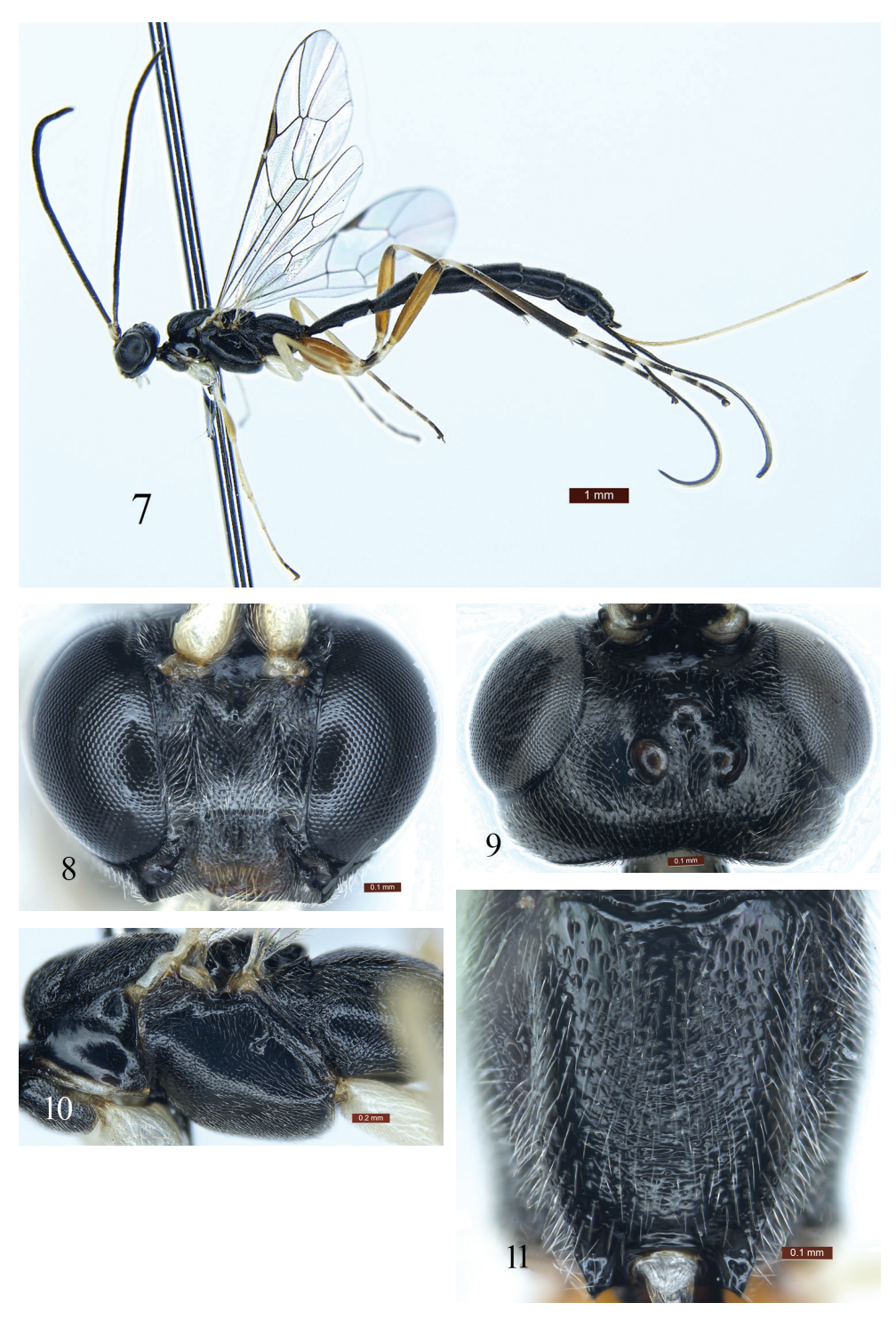
Figures 7–11. Poemenia quercusia Sun & Sheng, sp. n. Holotype. Female. 7 Habitus, lateral view 8 Head, anterior view 9 Head, dorsal view 10 Mesosoma, lateral view 11 Propodeum.