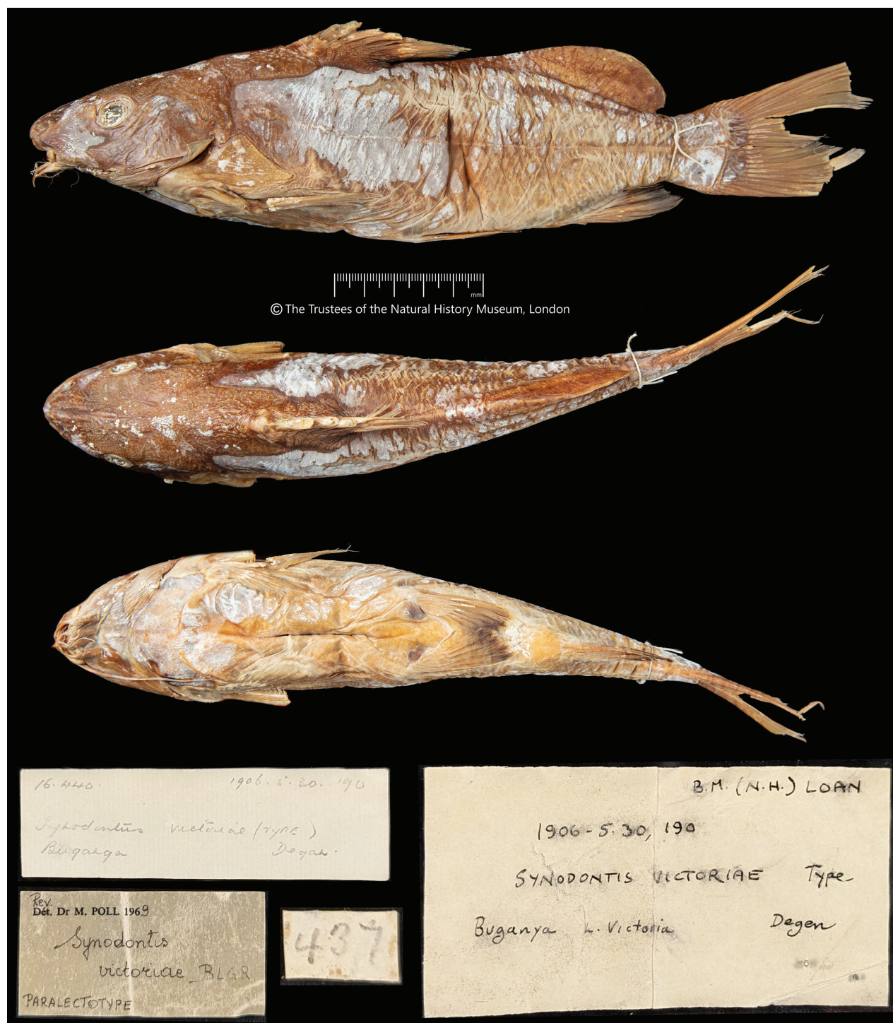
Figure 3. Synodontis victoriae BMNH 1906.5.30.190, paralectotype, 225.0 mm SL, Buganga, Lake Victoria, Uganda.