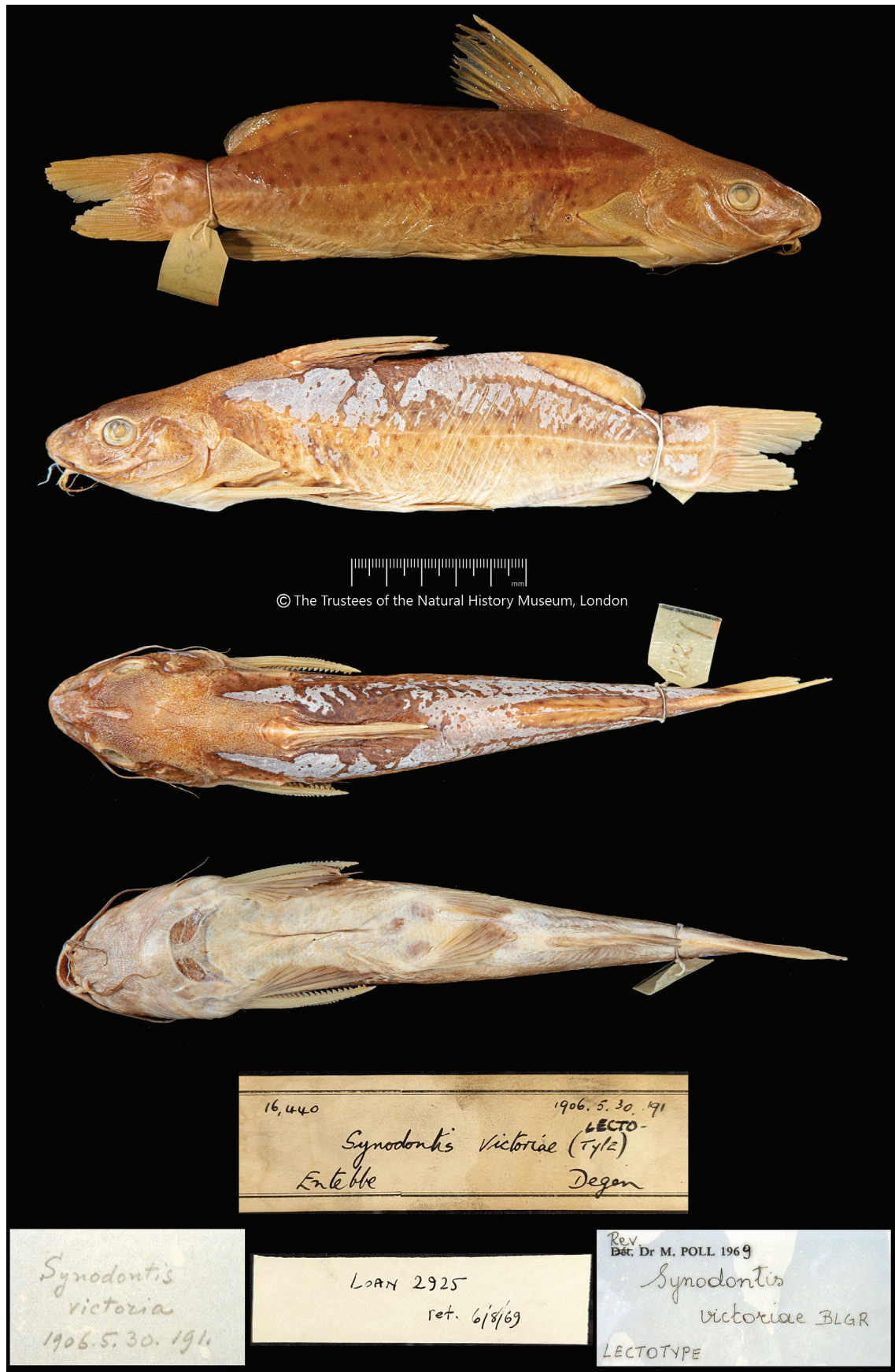
Figure 2. Synodontis victoriae BMNH 1906.5.30.191, lectotype, 188.2 mm SL, Entebbe, Lake Victoria, Uganda.