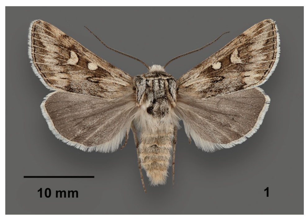
Figure 1. Protogygia pryorensis , paratype male, USA, Montana, Carbon County, Pryor Mountains, Petroglyph Canyon Natural Area.

(ibid., pl. I figs 24–28). However, P. pryorensis lacks the defining structural characters of this group: basal swelling and truncate apex of the uncus and truncate ampulla of the clasper (ibid., pl. 27 figs 1, 2). We assign P. pryorensis to the album -group based on its cylindrical apically hooked uncus and teardrop-shaped clasper, both typical of the other six species in this group (ibid., pl. 27 figs 3–8). All other species in the album -group except P. milleri are either nearly white or streaked longitudinally (ibid., pl. I figs 29–42).