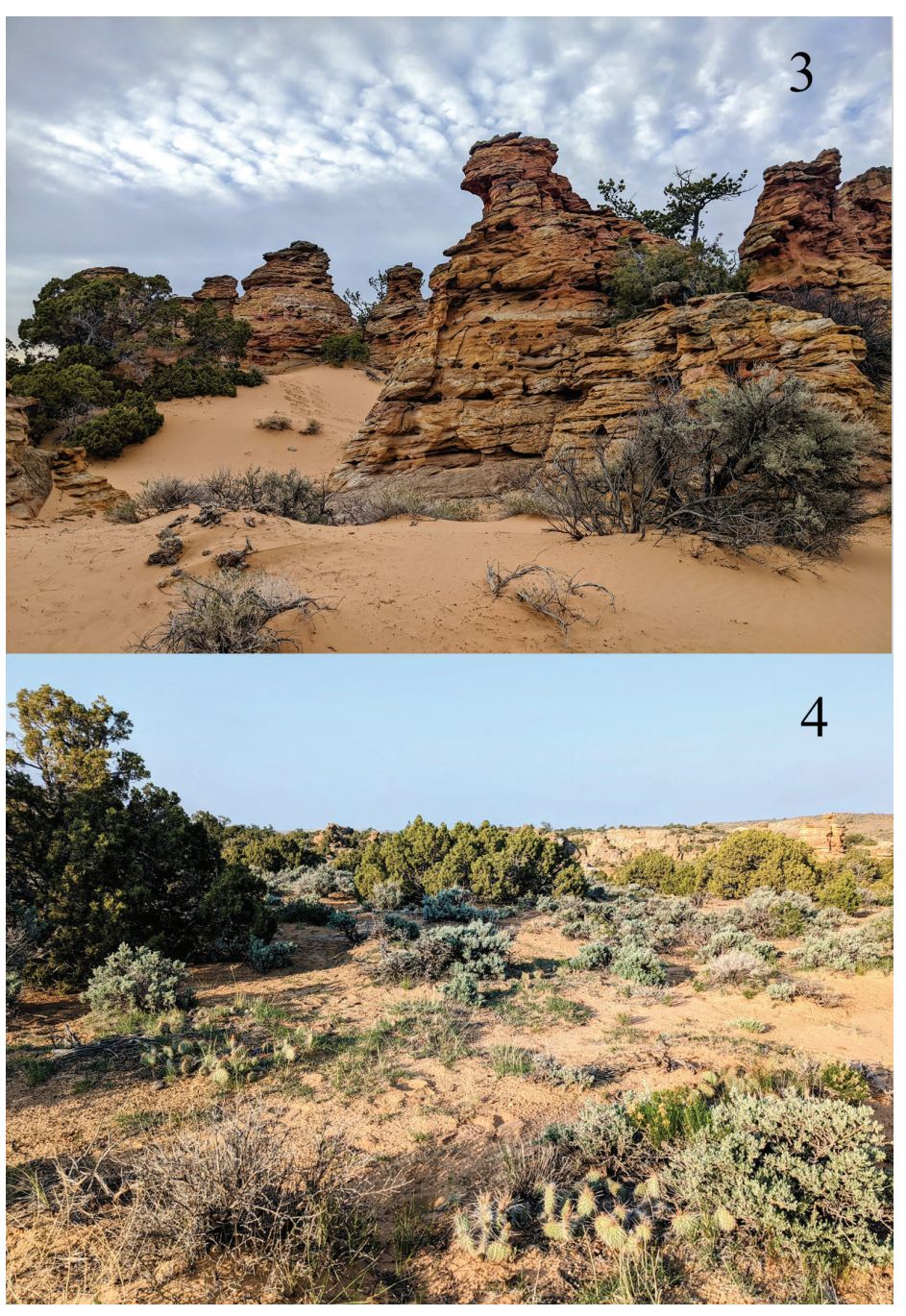
Figures 3, 4. Protogygia pryorensis habitat at Petroglyph Canyon Natural Area, Carbon County, Montana, USA 3 shows active sands and sandstone hoodoos at a canyon entry, while 4 is a nearby area of mixed soils and interspersed bedrock above the canyon rim. Sparse woody vegetation of Juniperus osteosperma , Pinus flexilis , Chrysothamnos viscidiflorus and Artemisia tridentata and mats of Opuntia polyacantha are depicted.

vapor light. All specimens were found from May 6 to May 9, with none collected May 19 or June 1, indicating a brief flight period. All six specimens from May 6, 2022 are fresh, while a few of the specimens from May 8 and 9, 2023 demonstrate slight wear. No females have been found.