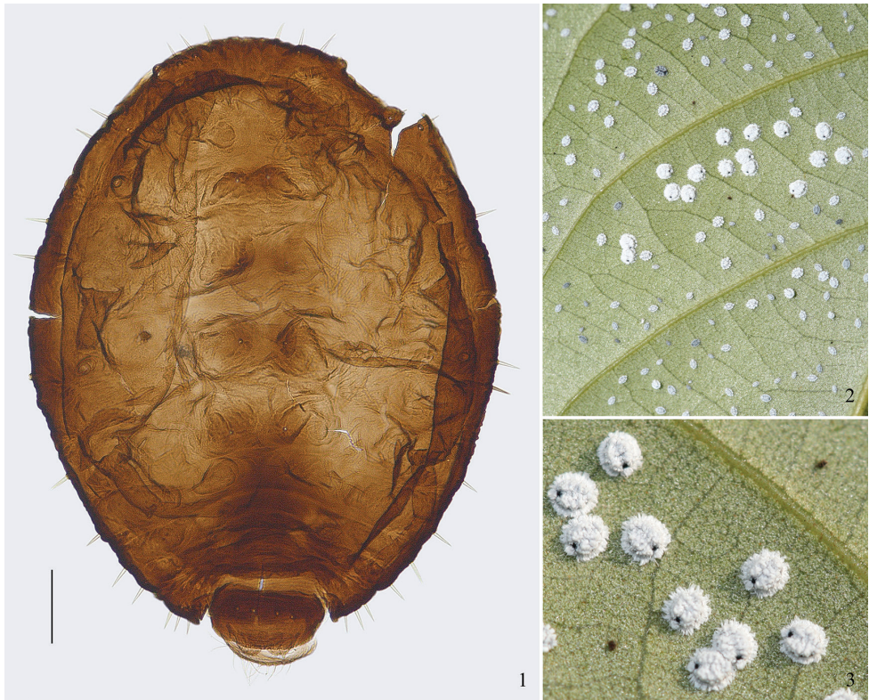
Figures 1–3. Parathoracaphis manipurensis (Pramanick, Samanta & Raychaudhuri). 1 Dorsal view of body of apterous viviparous female 2 a dense colony on underside of leaf of Castanopsis sp. 3 apterous adults in life, covered with much wax ( 2, 3 : Mt. Zixi, Yunnan, China; 22 Oct 2010). Scale bar: 0.10 mm.

Specimens examined. One apterous viviparous female, CHINA: Yunnan (Chuxiong City, Mt. Zixi), 22 Oct 2010, No. 24888, on Castanopsis sp., coll. X.L. Huang (NZMC); 1 apterous viviparous female, CHINA: Yunnan (Chuxiong City, Mt. Zixi), 22 Oct 2010, No. 24894, on Fagaceae, coll. X.L. Huang (NZMC).