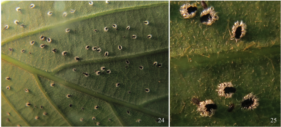
Figures 24–25. Parathoracaphis spinapilosa sp. n. (Mt. Longqi, Fujian, China; 17 Jun 2011) 24 A colony on underside of leaf of Quercus sp. 25 apterous adults in life, bearing long and curved wax filaments around the body.