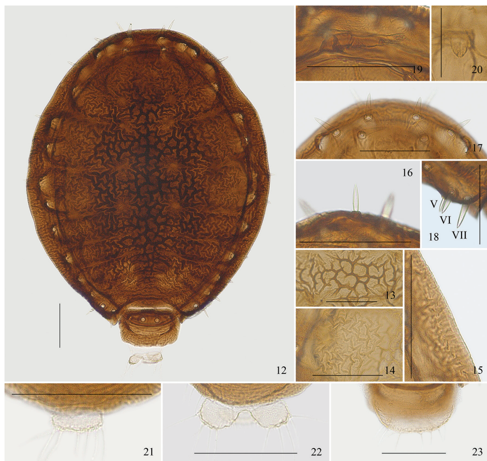
Figures 12–23. Parathoracaphis spinapilosa sp. n. Apterous viviparous female: 12 dorsal view of body 13 convoluted markings on medial area of prosoma dorsum 14 short folded-line shaped sculptures on pleuro-marginal area of prosoma dorsum 15 short transversely striped band on margin of prosoma 16 spine-like frontal seta on head 17 3 pairs of submarginal setae on head dorsum 18 submarginal setae on abdominal tergites V–VII 19 antenna 20 ultimate rostral segment 21 cauda 22 anal plate 23 genital plate. Scale bars: 0.10 mm.

two pairs of submarginal setae anterior to eyes, along the body margin, and a pair between eyes (Fig. 17) (the latter: all three pairs located along the body margin, Fig. 5); antennae 3- or 4-segmented (the latter: 2-segmented).