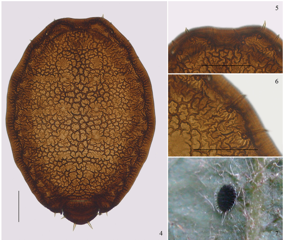
Figures 4–7. Parathoracaphis setigera (Takahashi). Apterous viviparous female: 4 dorsal view of body 5 submarginal setae on head dorsum 6 branched linear markings on marginal area of prosoma dorsum 7 apterous adult on underside of leaf of Quercus sp., bearing wax filaments marginally (Kunming, Yunnan, China; 5 Dec 2009). Scale bars: 0.10 mm.