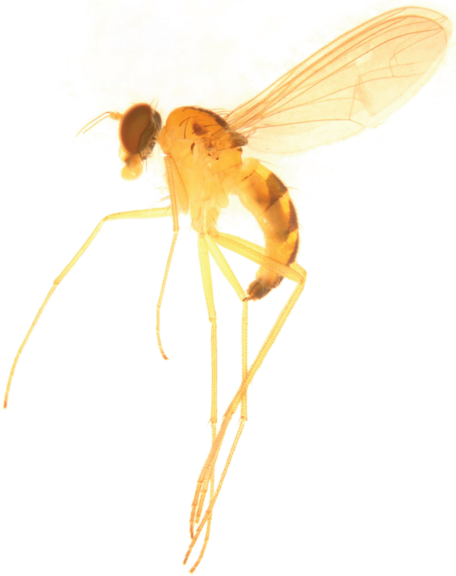
Figure 4. Sinosciapus liuae sp. n. (female).

Female. Body length 3.3–5.0 mm, wing length 3.6–4.4 mm. Similar to male, but different in following points: mesonotum yellow with a large metallic green mid-posterior spot nearly triangular and two small pale metallic green lateral spots nearly semicircular. Mid coxa with a brown outer stripe. Fore coxa with 4 long spine-like