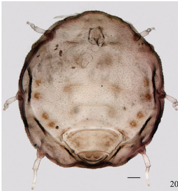
Figure 20. Neonipponaphis shiiae Takahashi. Apterous viviparous female, dorsal view of body. Scale bar = 0.10 mm.

Biology. This species colonizes the branches and shoots of the host plants (Takahashi 1962).