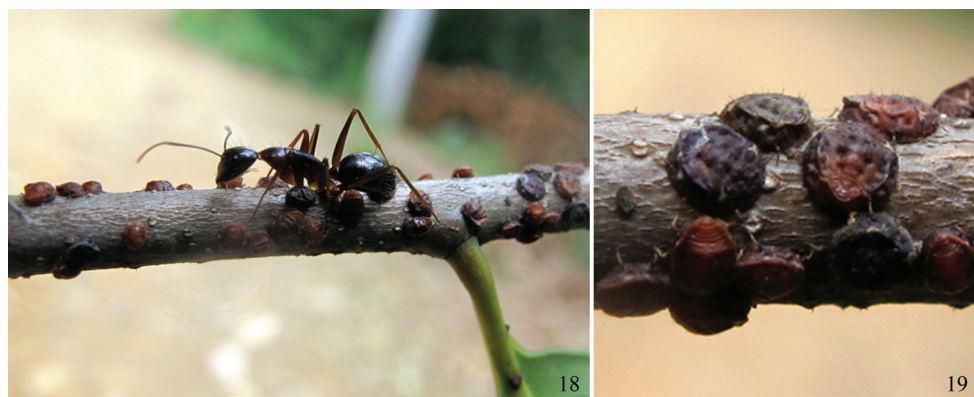
Figures 18–19. Neonipponaphis pustulosus sp. n. 18 a colony on the twig of Castanopsis eyrei , attended by an ant 19 apterous viviparous females in life.

placed wide apart at the apex of terminal segment. Rostrum short and thick, not reaching mid-coxae. Ultimate rostral segment blunt wedge-shaped, 1.43–1.78 times as long as its basal width, 1.23–1.64 times as long as second hind tarsal segment, with 2 pairs of primary setae and a pair of secondary setae (Figs 5, 12). Legs short, smooth, trochanter and femur fused (Fig. 9). Hind tibia 0.10–0.11 times as long as body. Setae on legs sparse, tibiae setae long and fine, hind tibiae with several short peg-like setae on distal part. Setae on hind tibia 0.79–1.00 times as long as its mid-width. First tarsal chaetotaxy: 2, 2, 2. Claws normal. Siphunculi small, pore-like, on abdominal tergite VI (Figs 6, 13). Cauda knobbed, constricted at base, 0.48–0.64 times as long as its basal width, with 7–10 setae (Figs 7, 14). Anal plate bilobed, each lobe with 4–6 setae (Figs 8, 15). Genital plate transversely oval, with two anterior setae and 12–16 setae along the posterior margin.