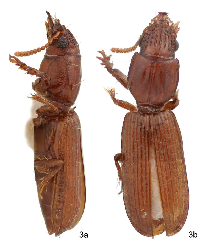
Figure 3. Color image, showing habitus of Halocoryza whiteheadiana sp. n. , 3a, left lateral aspect, 3b, dorsal aspect, ABL = 2.9mm; Holotype: Isla Del Carmen, BJ, México.