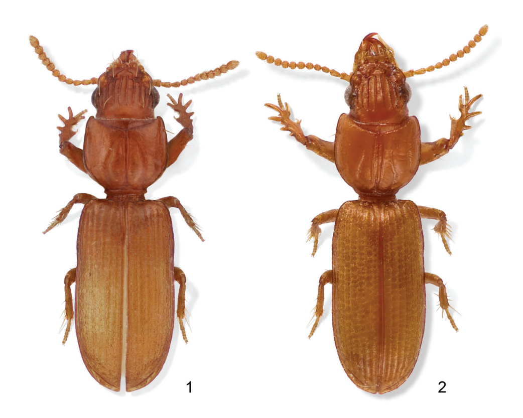
Figure 1–2. I Color image, showing habitus of Halocoryza acapulcana Whitehead, 1966, dorsal aspect, ABL = 2.4mm, ADP127171; Acapulco, México 2 Color image, showing habitus of Halocoryza arenaria (Darlington, 1939), dorsal aspect, ABL = 2.9mm, ADP116798; St. Johns, Virgin Islands.

MICROHABITAT: Adults are ground-dwelling on exposed wet substrate consisting of coquina-coral cemented by very fine silt or sand and covered with seaweed mats. DIS- PERSAL ABILITIES: Wing-polymorphic: macropterous form probably capable of flight; brachypterous form, consequently flightless thus vagility limited to walking or running; both forms slow runners. SEASONAL OCCURRENCE: Adults have been found in March – April, July, and October. BEHAVIOR: Adults are nocturnal predaceous halobionts and take cover in the sand or under drift and piles of seaweed on the beach. Populations of this species are associated with the centipede Pectiniunguis halirrhytus Crabill. In the northern part of their range, adults overwinter in the substrate; in the southern part, they likely aestivate during the dry season in the substrate.