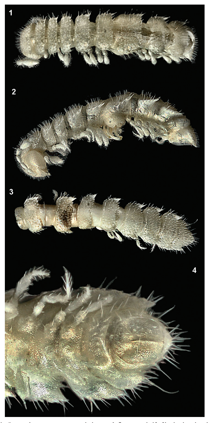
Figures 1–4. Caucasodesmus tauricus sp. n., holotype. 1, 2 anterior half of body, dorsal and lateral views, respectively 3, 4 posterior portion of body, dorsal and ventral views, respectively. Photographed not to scale.