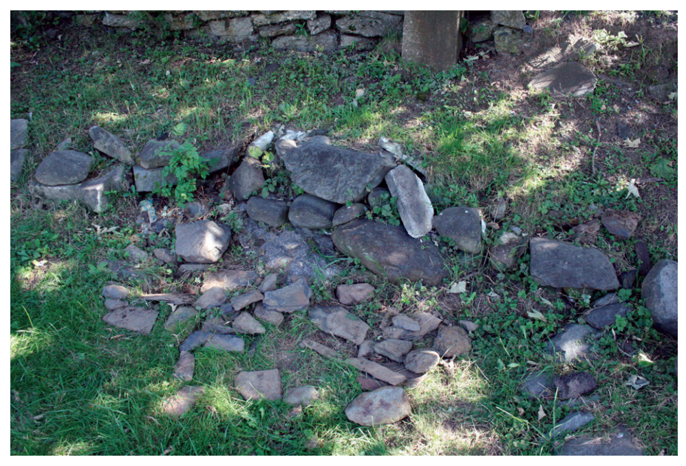
Figure 5. The collection locale of the Phosphaenus hemipterus larvae in the Holy Cross site in a rock pile. Note the rock wall in the background.