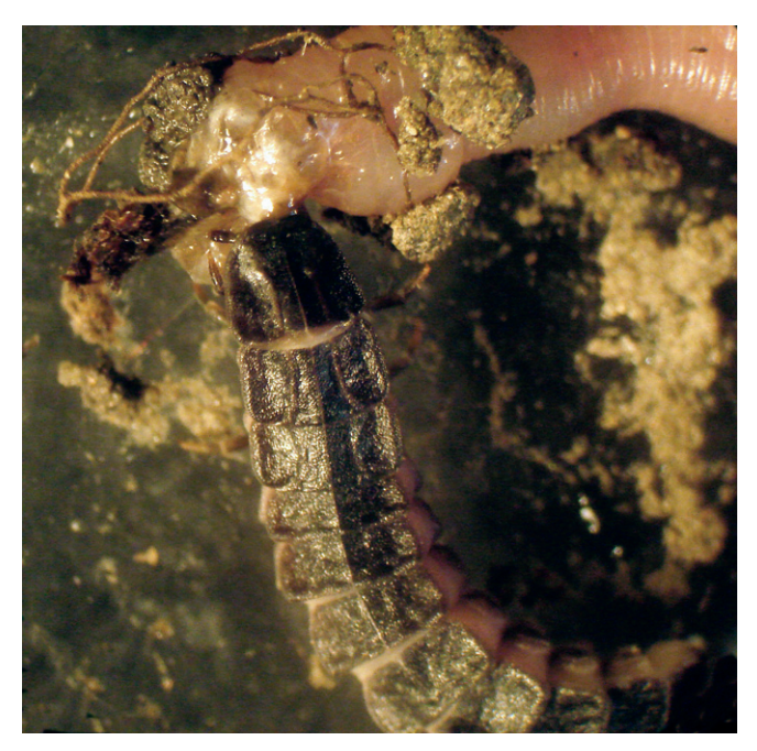
Figure 6. A Phosphaenus hemipterus larvae feeding on an earthworm ( Lumbricus terrestris ). While feeding, the tarsal claws of the legs anchor the larva to the body of the earthworm and the extended antennae move over the surface of the earthworm's body.