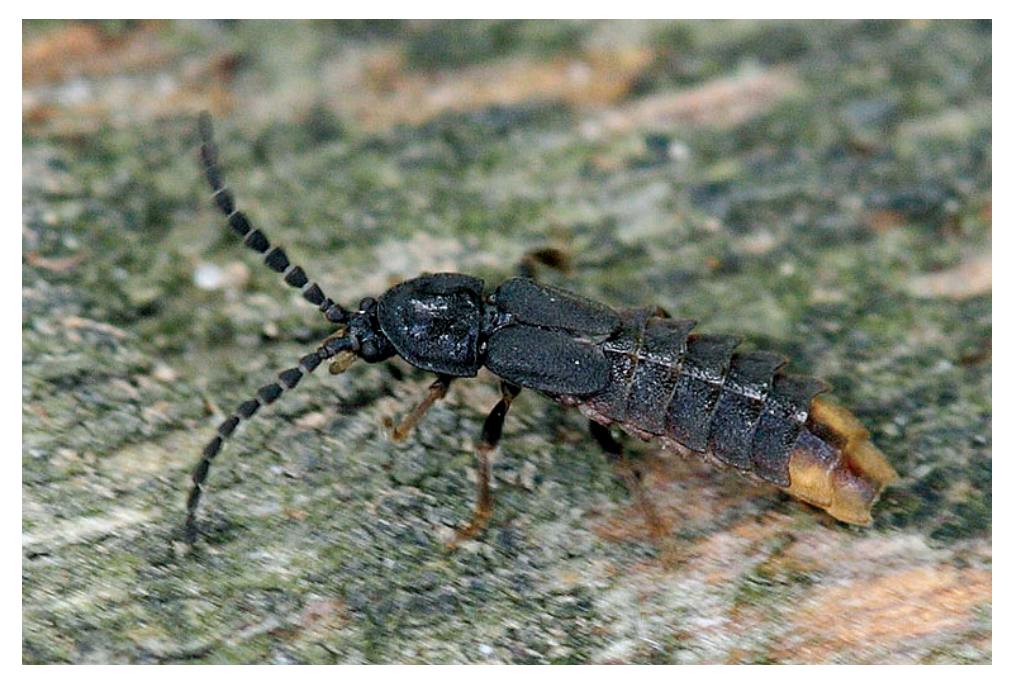
Figure 1. An adult male specimen of Phosphaenus hemipterus (photographed in Switzerland). Note the broad antennae, small eyes, lampyrid-shaped pronotum, and the shortened elytra exposing seven abdominal segments, the last two bearing bioluminescent organs.

of females (De Cock et al. in press). Although Branham and Wenzel's (2003) cladistic analysis of the Lampyridae places P. hemipterus within the "daytime dark fireflies", it is, however, bioluminescent. In all these regards P. hemipterus is an unusual lampyrid.