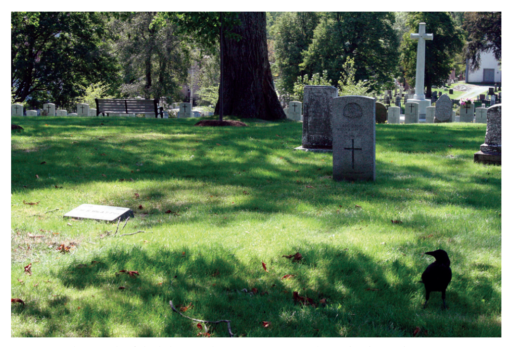
Figure 2. Photograph of the habitat at the Fort Massey site where Phosphaenus hemipterus specimens were collected. Foraging birds, such as the American Crow ( Corvus brachyrhynchos ) in the foreground, could be potential predators of diurnal beetles such as P. hemipterus .

The Queen St. site consists of two strips of lawn built on top of a one-storey parking garage over 20 years ago. Water drains poorly from one of the strips of lawn, and after a rainfall it can remain damp for a period of time. The site has scattered Norway