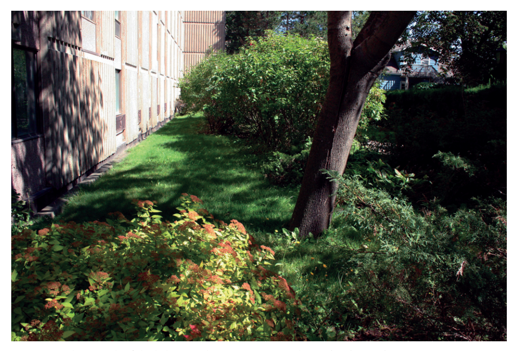
Figure 4. Photograph of the habitat at the Queen St. site where Phosphaenus hemipterus specimens were collected. Note the concrete wall of the apartment building directly abutting on the lawn area. In the foreground is the trunk of an ash tree, and a row of shrubs consisting of goldflame spiraea, fly honeysuckle, red-ozier dogwood, and eastern redcedar.

the Nova Scotia Museum and Canadian National collections. On 9 September 2009, over a span of six hours, four P. hemipterus larvae were collected at the Fort Massey site and the adjacent Holy Cross site. These were found in the earth at a depth of ~ 8 cm beneath one of the pitfall traps under a horse chestnut, and under a rock in a pile of stones beneath a Norway maple (Fig. 5).