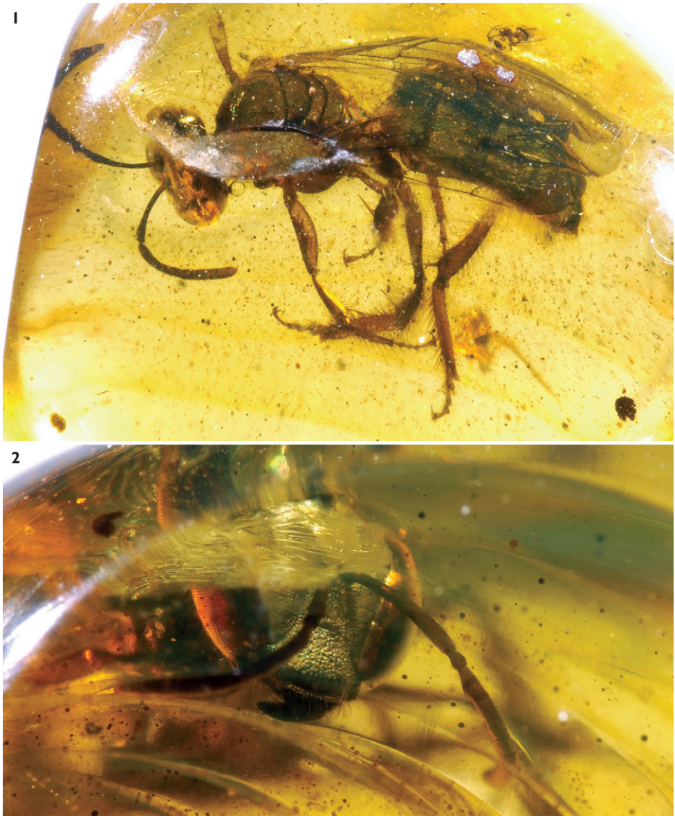
Figures 1–2. Photomicrographs of holotype female of Oligochlora semirugosa sp. n. (KU-DR-21). 1 Dorsolateral oblique aspect of holotype 2 Facial aspect.

with small punctures anteriorly separated by a puncture width or less, gradually becoming more closely packed posteriorly until contiguous and irregular such that integument appears weakly rugulose; metanotum longitudinally rugulose, integument between rugae granular and impunctate; basal area of propodeum granular with short striae along basal margin, striae not reaching to one-third length of basal area, lateral and posterior surfaces of propodeum granular and apparently impunctate (difficult to discern posterior and lat-