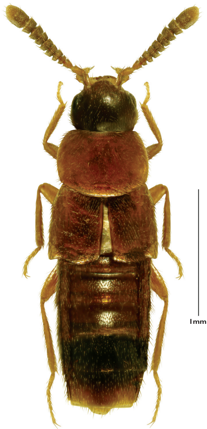
Figure 1. Oxypoda stanleyi Klimaszewski & McLean, sp. n., dorsal habitus.