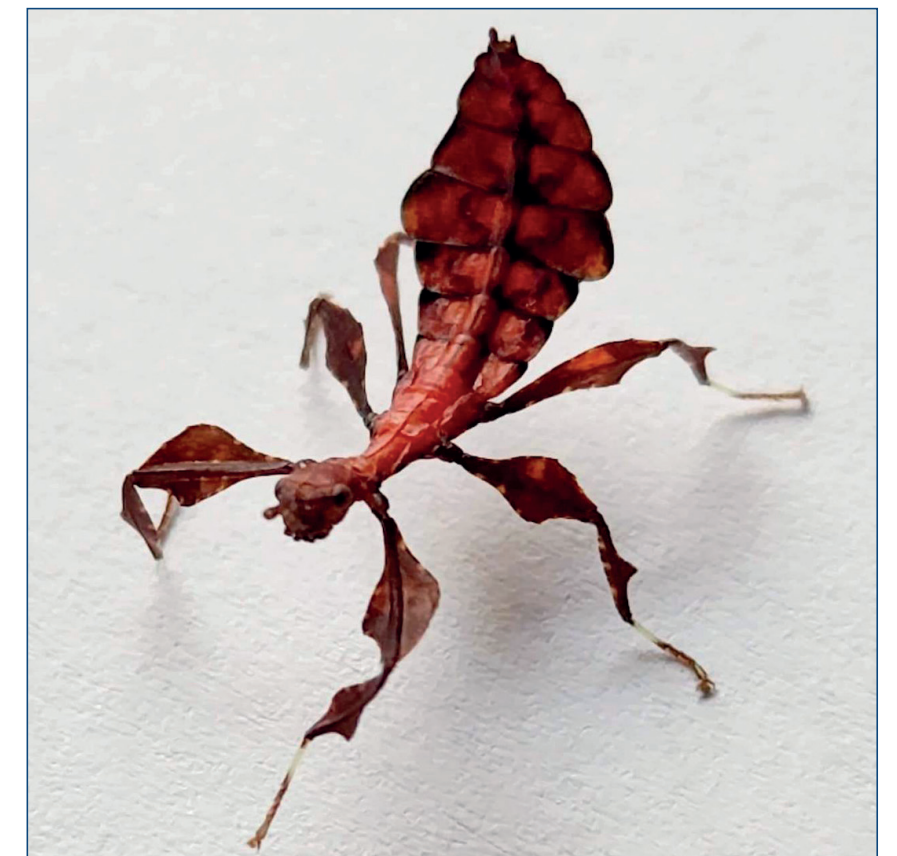
Pulchriphyllium bhaskarai Royce T. Cumming et al., sp. nov.