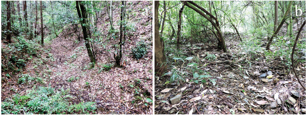
Figure 3. Habitat environment of Macromotettixoides parvula sp. n. a a gully in a broad-leaved forest b border of a stream. Pictures were photographed by Lingsheng Zha in China, Guizhou, Leishan, Leigongshan Mountain, 2 Aug 2016.

low, apex or nearly right angled or a little sharp, genicular denticle finger-like, extending backward and apex obtuse; margins of fore and mid tibiae straight; two inner margins of hind tibia serrate, terminal part slightly wider than basal part, outer/inner side with 6-7/4-6 spines; first segment of hind tarsus 1.35 times as long as second plus third, first and second pulvilli small and apices sharp, third pulvillus large and apex obtuse (Fig. 2h).