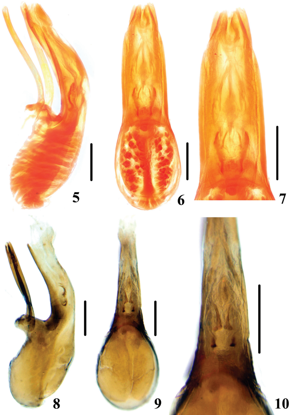
Figures 5–10. 5–7 E. zhuxiaoyui sp. n. 5 aedeagus in lateral view 6 aedeagus in dorsal view 7 details of internal sac 8–10 E. semirufum Lewis 8 aedeagus in lateral view 9 aedeagus in dorsal view 10 details of internal sac. Scales = 0.25 mm.