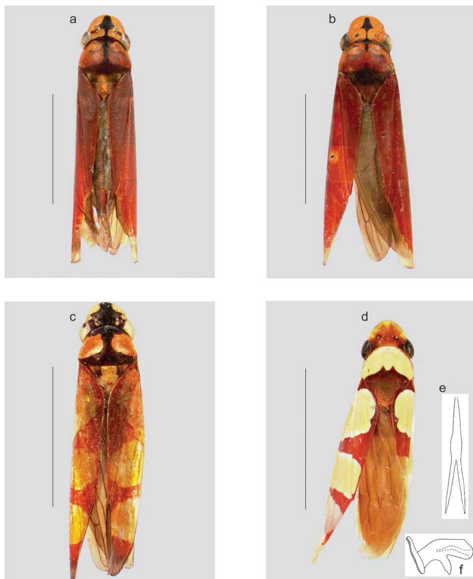
Figure 3. a–c color variation in Kogigonalia incarnata (Germar, 1821), comb. n., body, dorsal view: a–b male and female syntypes, respectively, from the state of Bahia, northeastern Brazil (Museum für Naturkunde, Universität Humboldt, Berlin) c female from Brazil d–f K. enola Young, 1977, male holotype from French Guiana (United States National Museum, Washington, D.C.): d body, dorsal view e paraphyses, dorsal view f aedeagus, lateral view. a–d reproduced, with permission, from Wilson et al. (2009) e–f redrawn from Young (1977). Scale bars = 5 mm.

lateral view, slightly expanded beyond basal curvature; basal hyaline area distinct; dorsal margin approximately rectilinear, with about 40 continuous teeth (Fig. 2i–k) that are progressively smaller toward apex; most teeth subtriangular but posterior ones quadrate;