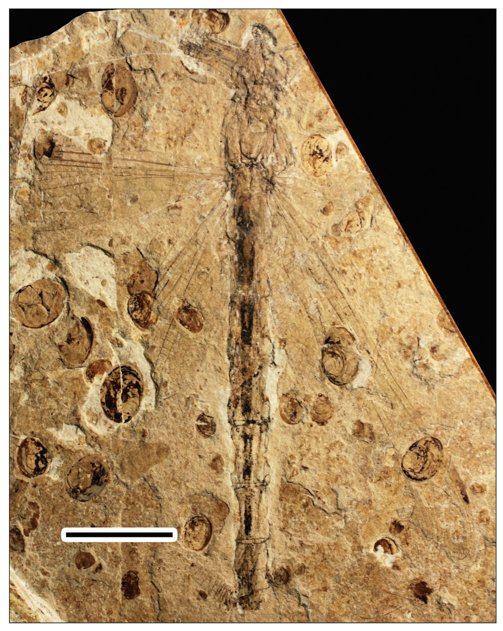
Figure 1. Photo of positive imprint of CNU-ODO-NN2012004. Scale bar represents 10 mm.

mm wide; discoidal cell basally closed, 1.6 mm long, 0.5 mm wide, free of cross-veins, length of proximal side, 0.8 mm; RP + MA separates at approximately a right angle from RA and strongly curved in arculus; RP separated from MA 0.3 mm distally; just distal of arculus base, MA basally strong and divided into MAa and MAb distally; MAb short, 0.8 mm long, aligned with distal free part of CuA; MP + CuA separated into MP and CuA at distal end of MAb; distal free part of CuA strong, separates from