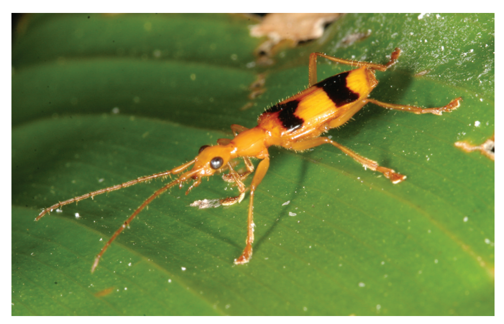
Figure 4. Calophaena ligata on an uncoiled Calathea lutea-leaf. M. Schmitt phot.

Individuals of the ground beetle, Calophaena ligata Bates, 1883 (Carabidae: Harpalinae, Fig. 4) (29 individuals) were found on Calathea lutea exclusively, co-occurring with Cephaloleia belti (11), C. championi (19), C. dilaticollis (7), C. histrionica (4), and Chelobasis perplexa (1). Four C. ligata -individuals were found in a single leaf roll without any hispine company. These beetles always sat on the inner surface of the leaf roll and were never found between two layers of a roll. We could never observe them feeding inside the leaf roll, nor could we find them on an uncoiled Zingiberales leaf at daylight.