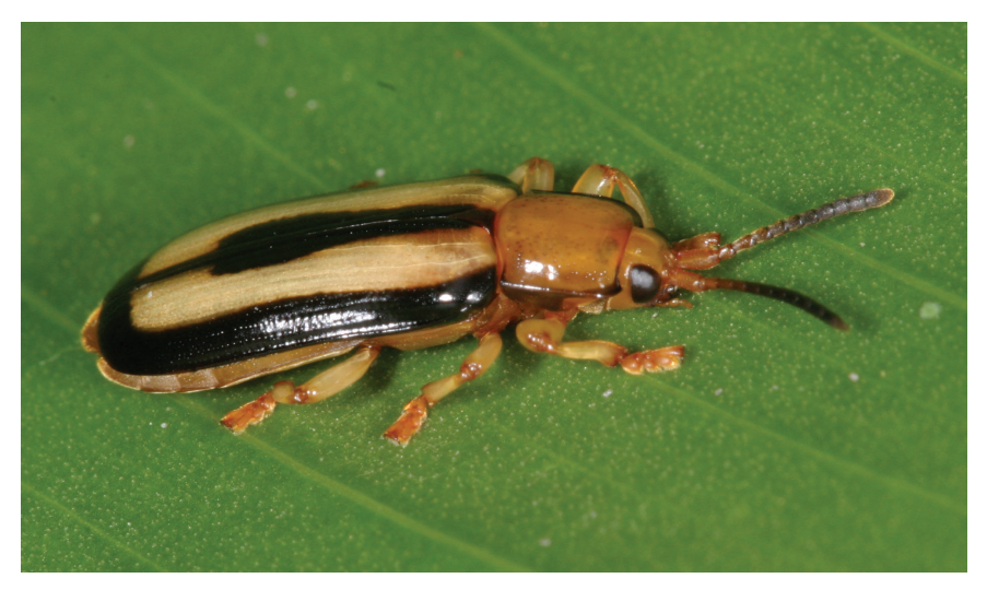
Figure 1. Cephaloleia championi from an unrolled Heliconia-leaf at La Gamba.

belti Baly, 1885, C. championi Baly, 1885 (Fig. 1), C. dilaticollis Baly, 1858, C. distincta Baly, 1885, C. histrionica Baly, 1885, C. instabilis Baly, 1885, C. trivittata Baly, 1885 and the Arescini Chelobasis bicolor Gray, 1832 (Fig. 2) and Ch. perplexa Baly, 1858. They were collected from 17 identified and at least two unidentified Zingiberales species: Alpinia purpurata (Zingiberaceae), Calathea crotalifera , C. lutea , C. platystachya , and Goeppertia lasiophylla (Marantaceae), Costus barbatus and C. pulverulentus (Costaceae), Heliconia danielsiana , H. densiflora , H. imbricata , H. latispatha , H. longiflora , H. rostrata , H. stricta , H. vaginalis , and H. wagneriana (Heliconiaceae), and Musa paradisiaca (Musaceae). The numbers of the collected beetles and the respective potential host plants are given in Table 1. The beetle records are unequally distributed over their potential host plants. Of all species found in more than 20 individuals and on more than one potential host plants.