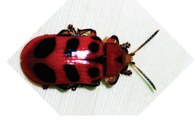
Figure 2. Chelobasis bicolor, La Gamba.