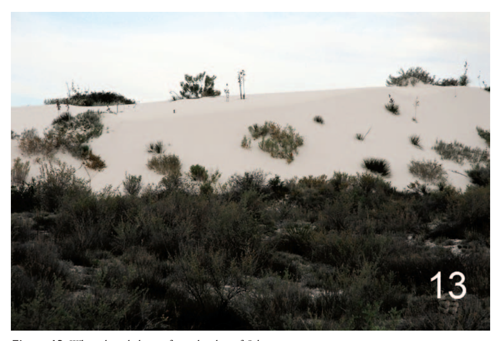
Figure 13. White dune habitat of type locality of Schinia poguei.

White Sands National Monument preserves 284.9 km<sup>2</sup> (110 square miles), or about 40%, of the world's largest snow-white gypsum dune field. The remainder of the 275 square miles dune field is under the jurisdiction of the U.S. Army in the White Sands Missile Range. The dune field is located in the northern Chihuahuan Desert in southern New Mexico's Tularosa Basin (Schneider-Hector 1993). In 1950 Stroud