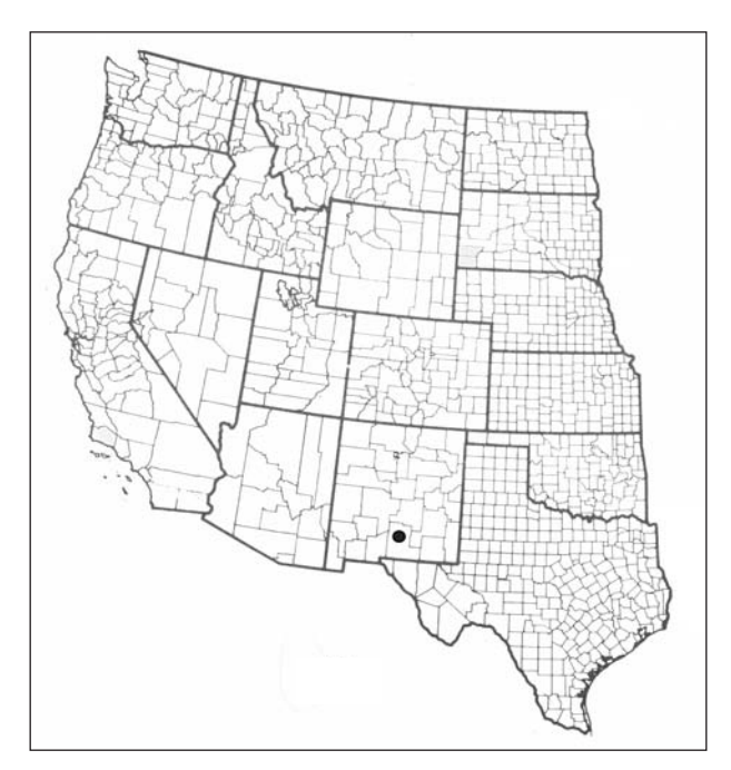
Figure 14. Distribution map for Schinia poguei.

reported twenty species of Lepidoptera from the Monument. In the period 9 February 2007 through 31 December 2010 Metzler and Forbes identified more than 430 species of Lepidoptera (unpublished data) from the Monument. A complete description of the study site and some of its unique biological resources is in Metzler et al. (2009).