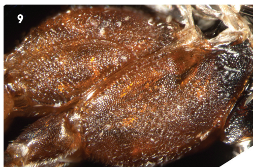
Figures 6–10. Ateleute zixiensis Sheng, Broad & Sun, sp.n. Holotype. Female 6 Body, lateral view 7 Head, anterior view 8 Basal portion of flagella 9 Mesosoma, lateral view 10 Terga 1 to 3.