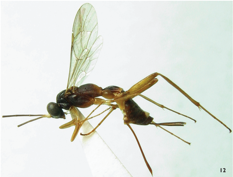
Figures 11–12. Ateleute densistriata (Uchida, 1955) 11 Male body, lateral view 12 Female body, lateral view.

Lin-Da Li. 2 males, CHINA: Matubei, 330 m, Quannan County, Jiangxi Province, 27 May 2009, leg. Shi-Chang Li. 3 males, CHINA: Wuyishan, 1170 to 1200 m, Qianshan County, Jiangxi Province, 22 June to 11 July 2009, leg. Zhi-Yu Zhong. 2 males, CHINA: Quannan County, Jiangxi Province, 4 to 11 October 2009, leg. Shi-Chang Li. 1 male, CHINA: Quannan County, Jiangxi Province, 31 May 2010, leg. Shi-Chang Li. 17 males, CHINA: Jiulianshan, 580 m to 680 m, Longnan County, Jiangxi Province, 20 April to 6 June 2011, leg. Mao-Ling Sheng and Shu-Ping Sun. 1 female, CHINA: Shizikou, 200 m to 210 m, Anfu County, Jiangxi Province, 21 June 2011, leg. Zhong-Ping Yu.