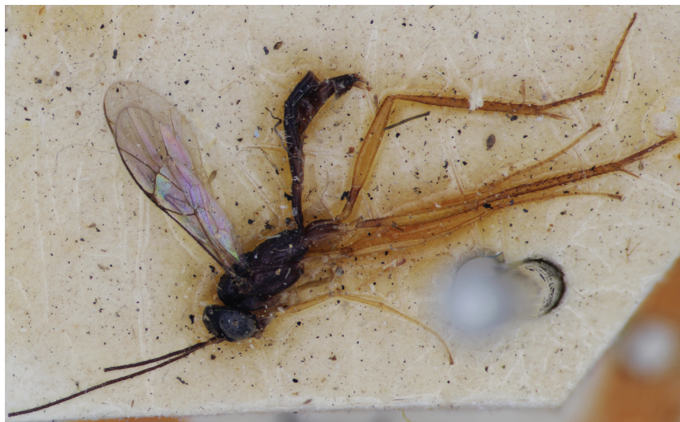
Figures 13. Ateleute spinipes (Cameron, 1911). Holotype. Male body, lateral view.