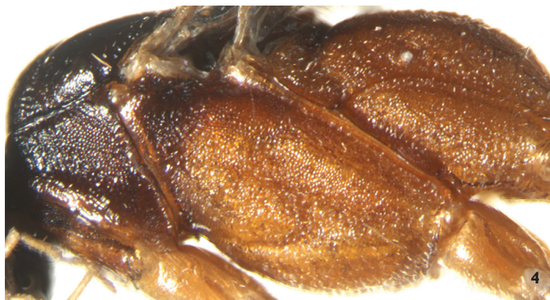
Figures 1–5. Ateleute ferruginea Sheng, Broad & Sun, sp.n. Holotype. Female 1 Body, lateral view 2 Head, anterior view 3 Basal portion of flagella 4 Mesosoma, lateral view 5 Terga 1 to 3.