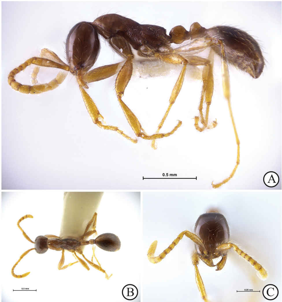
Figure 1. Aenictus nuchiti sp. n. (holotype, worker, THNHM-I-02612). A Body in profile B Body in dorsal view C Head in full-face view.