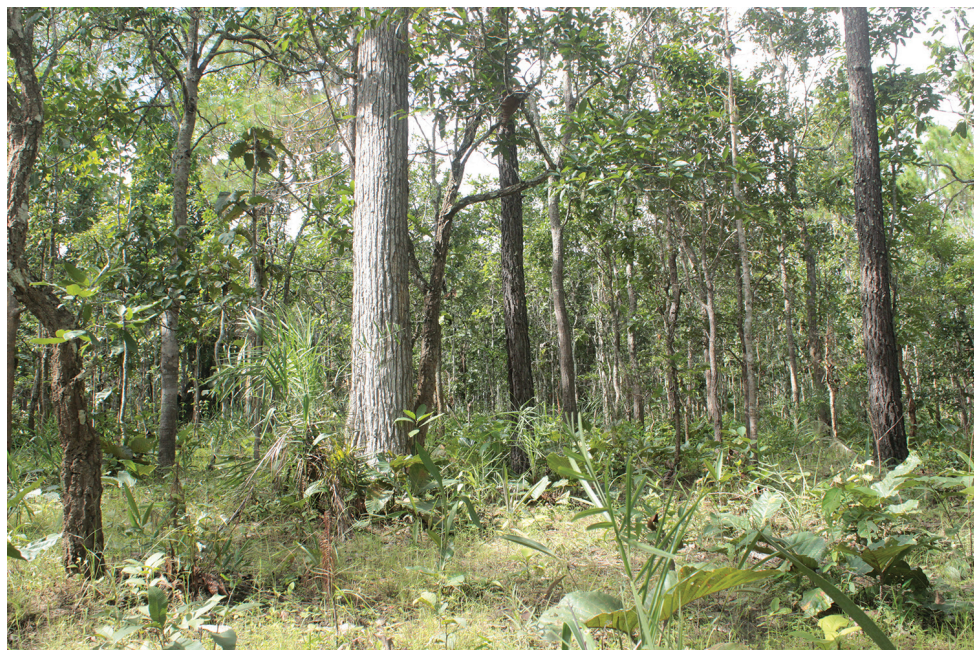
Figure 4. Type locality of Aenictus nuchiti sp. n., dry dipterocarp forest in Chiang Mai Province, northern Thailand.