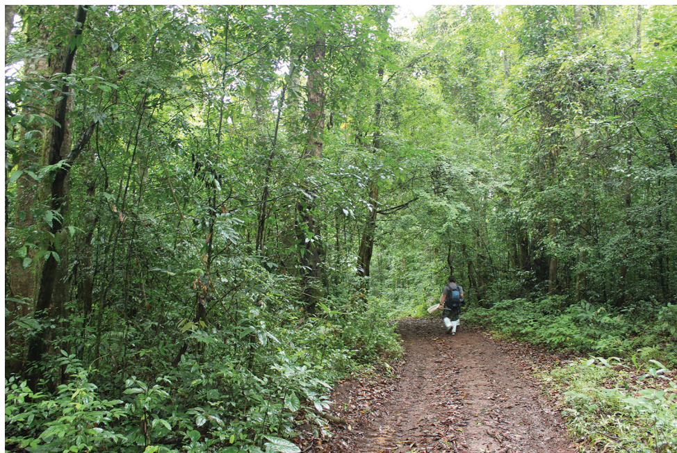
Figure 5. Type locality of A. samungi sp. n., dry evergreen forest in Tak Province, western Thailand.