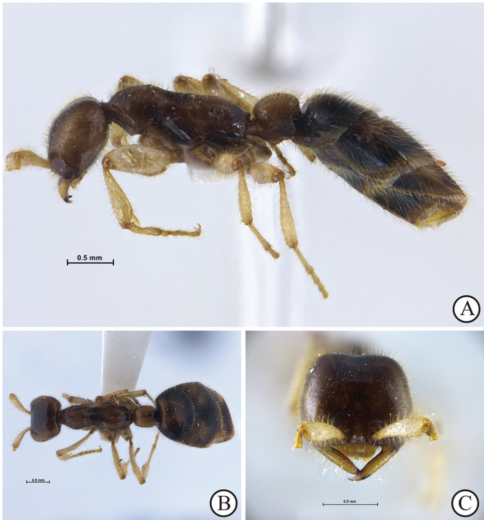
Figure 2. Aenictus nuchiti sp. n. (paratype, queen, THNHM-I-02613). A Body in profile B Body in dorsal view C Head in full-face view.

cles. Mandible half as long as head length, with a slender, inner margin that is convex while lateral margin weakly concave; masticatory margin without denticles. Mesosoma elongate; in profile, pronotum convex dorsally; mesonotum weakly concave; propodeal dorsum almost straight; seen from above pronotum and propodeum broader than mesonotum; propodeal junction low, roundly convex; propodeal declivity weakly convex, not encircled by a rim. Petiole longer than high, with its dorsal outline slightly elevated posteriorly, with petiole in profile posterodorsal corner bluntly angulate; seen from above petiole with a distinct longitudinal furrow running from anterior face to posterior face; subpetiolar process large, subtriangular, with its apex pointed downwards. Gaster large and elongate; first tergite narrower and shorter than second, its