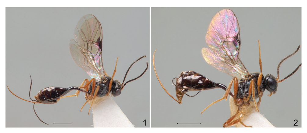
Figures 1–2. Phradis peruvianus sp. n. I holotype 2 paratype.

more or less distinct fine transverse wrinkles. Basal part of propodeum short, 0.25–0.27 times as long as apical area. Basal longitudinal carinae indistinct, propodeum dorsally with broad impressed area with few longitudinal wrinkles. Propodeal spiracle very small, round; distance between spiracle and pleural carina equal to about 3.0 diameters of spiracle. Apical area flat, anteriorly broadly rounded, sometimes slightly truncated.