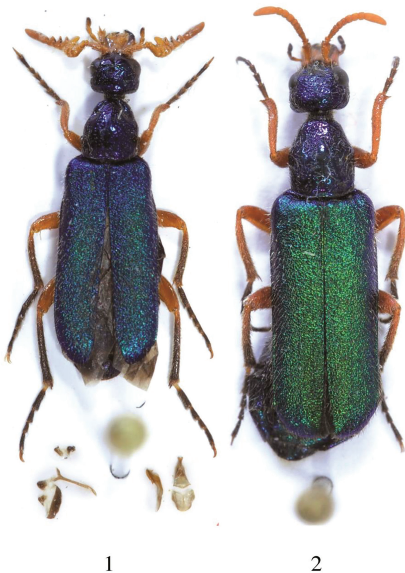
Figure 1–2. Diphorocera neglecta sp. n., 1 holotype male and 2 paratype female.

Systematic remarks. Turco and Bologna (2007) established three groups of species within the genus based on a cladistic analysis: (i) the obscuritarsis group ( carinicolis , johnsoni , obscuritarsis ) with the last male antennomere subquadrate and unmodified simple foretibiae; (ii) the promelaena group ( promelaena ) characterised by the last antennomere elongate, male foretibia modified only distally and by black body and pronotum; (iii) the hemprichi group ( chrysoprasis , hemprichi , sicardi , peyerimhoffi ) with the last antennomere elongate and foretibiae modified.