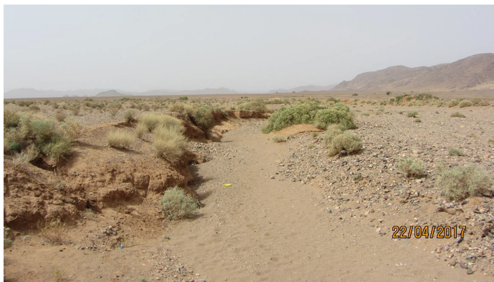
Figure 7. Habitat of the type locality of Diaphorocera neglecta sp. n.

Ecological remarks. All specimens were collected in a small area with many plants in bloom at the bottom of a dry river bed (wadi) at 872 m a.s.l., together with other species of Meloidae, namely Diaphorocera promelaena , Mylabris (Ammabris) myrmidon Marseul, 1870, Hycleus saharicus (Chobaut, 1901), H. novemdecimpunctatus (A.G. Olivier, 1811), Actenodia suturifera (Pic, 1896), Croscherichia litigiosa (Chevrolat, 1840), Lyttolydulus nubeculosus Kaszab, 1952, Cabalia rufiventris (Walker, 1871) and Lydomorphus sp. ( chanzyi (Fairmaire, 1876) ?), all typical Saharan elements.