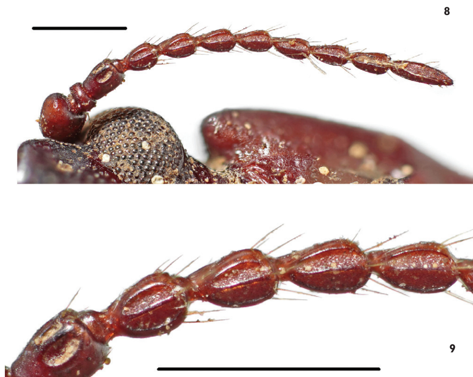
Figures 8–9. Birandra ( Yvesandra ) latreillei , lectotype of Parandra laevis Schönherr, 1817, antenna: 8 ventral view 9 ventral view, detail. Bar = 1 mm.

Domingo] [18]51–116 [purch. of Salle], compared with type C.J.G. [C. Gahan], Parandra laevis T. Arigony det. 1980 (NHM(UK); 3 ♂, 1 ♀ Dominican Republic, Guaimati, July, 1925, Pres. by Imp. Inst. Ent. Brit. Mus. 1930–336, Parandra laevis T. Arigony det. 1980 (NHM(UK); 2 ♂, La Vega: Constanza (“Paraje Los Flacos, Valle Nuevo”), IX.1962, E. Marcano col. (MZSP); 1 ♂, Hato Mayor: Parque Nacional los Haitises (3 km W Cueva de Arena; 19°04'N, 69°29'W), VII.7–9.1992, S. Davidson Col. (MZSP); 2 ♀, Monsenor Nouel: 8 miles W Jayaco, VIII.03.1967, J.C.Schaffner col. (MZSP).