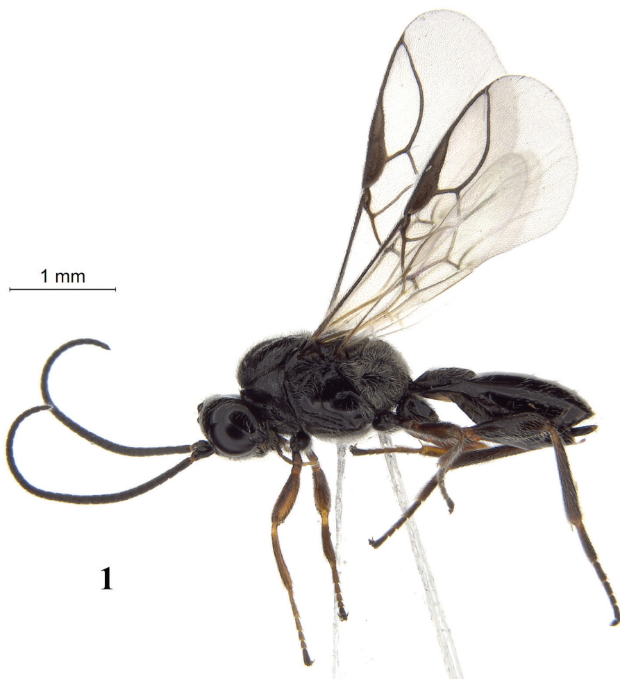
Figure 1. Chorebus (Stiphrocera) hexomyzae sp. n., female, paratype, habitus lateral.

mandible with four teeth, middle tooth (= t2) wide triangular, acute, much longer than both lateral teeth, with an extra protuberance on ventral side of middle tooth and ventral (= t3) tooth rather close to base of mandible resulting in apically narrowed mandible (Figs 10, 12–19); notauli nearly complete and largely smooth (Fig. 4); lateral lobes of mesoscutum largely glabrous; length of vein r of fore wing almost equal to width of pterostigma (Fig. 2); vein CU1b short of fore wing short and first subdiscal cell closed and robust; vein 3-SR+SR1 rather short and regularly bent, resulting in a robust marginal cell (Fig. 2); first tergite slightly longer than its apical width, evenly convex and longitudinal rugae not obscured by setosity, dorsope small, and dorsal carinae united and connected with median carina (Fig. 5); second tergite smooth and posterior half sparsely setose (Fig. 11); setose part of ovipositor sheath 0.05 times as long as fore wing and 0.2 times as long as hind tibia (Fig. 1).