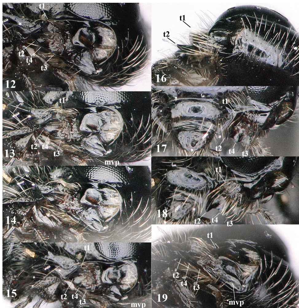
Figures 12–19. Chorebus (Stiphrocera) hexomyzae sp. n., female, holotype. 12–19. Mandible at different angles; t1, t2, t3 = upper, middle and lower tooth, respectively; t4 = additional tooth on ventral side of middle tooth.

nearly straight and distinctly converging to 1-M posteriorly; first subdiscal cell 2.1 times as long as wide; M+CU1 largely unsclerotised. Hind wing: M+CU:1-M:1r-m = 30:14:13; m-cu absent; cu-a straight.