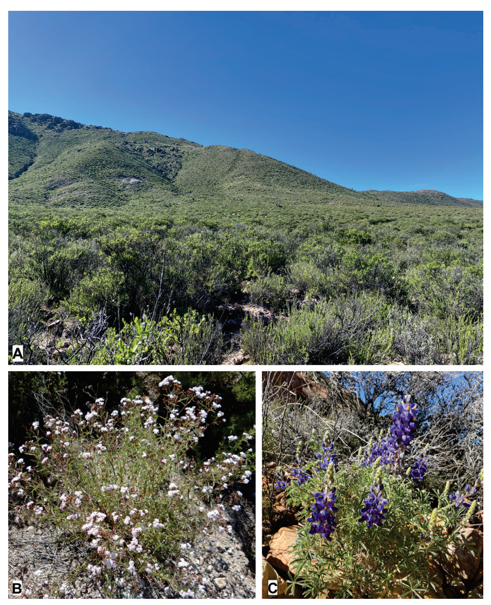
Figure 3. Habitat and host plants of Argyrotaenia socoromaensis sp. nov. A habitat at the type locality, near Socoroma Village, at 3400 m elevation on the arid western slope of the Andes of northern Chile B Stevia philippiana Hieron. (Asteraceae) C Lupinus oreophilus Phil. (Fabaceae).

abundant yellowish-brown scales mostly near tegula; antemedian interfascia with yellowish-brown scales mostly between posterior lobe of the basal fascia and posterior margin of the wing; median fascia with almost uniform width from costa to discal cell, broadened from discal cell to posterior margin of the wing; postmedian interfascia with broad posterior expansion reaching tornus, clearly separating medial fascia from tornal blotch; subapical blotch somewhat triangular. Hind wing similar to male, but termen slightly concave near apex. Abdomen. Mostly dark gray with scattered whitish gray scales. Female genitalia (Fig. 2D–F). Papillae anales elongate, flattened, narrow, slightly broadened posteriorly, roughened, with setae. Apophyses posteriores about 1.2 times length of papillae anales; apophyses anteriores about 1.4 times length of papillae anales. Sterigma a narrow stripe between the antrum and apophyses anteriores, angled near antrum; antrum somewhat cup-shaped, truncate anteriorly, ventral wall about half