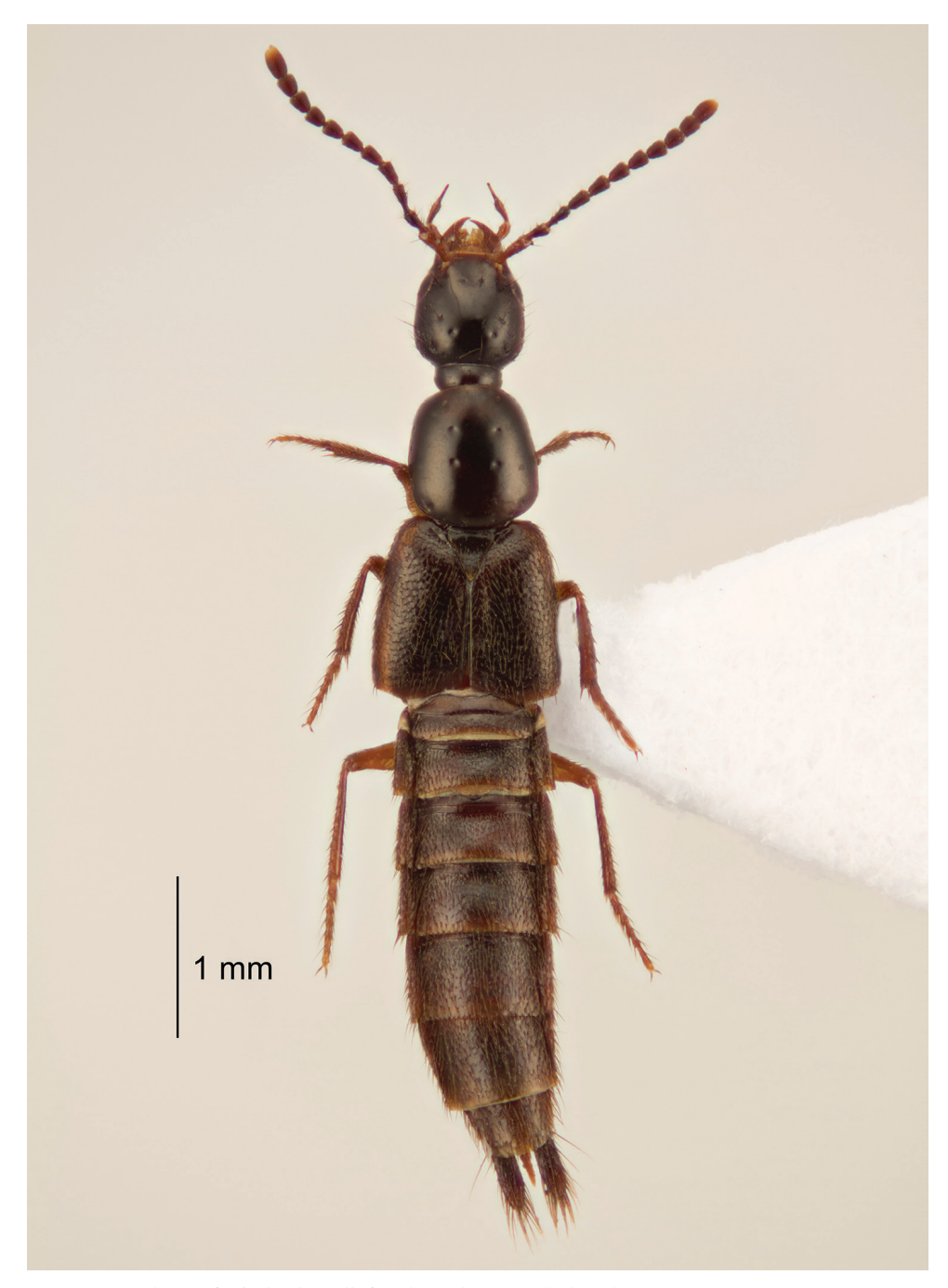
Figure 3. Habitus of Cheilocolpus olliffi Jenkins Shaw & Solodovnikov, sp. n.