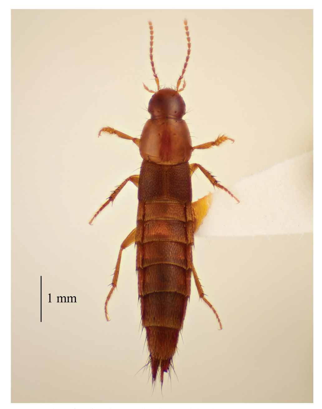
Figure 4. Habitus of Quediopsis howensis Jenkins Shaw & Solodovnikov, sp. n.

Howe Island, 17–31.v.1980, S. + J. Peck / Stevens Reserve, 10', 24.v.80, moist litter in limestone sink, 16 L Ber'; 1 male, 'AUSTRALIA: N.S.W. Lord Howe Island, 17-31.v.1980, S. + J. Peck / Intermediate Hill, 300', 18.v.1980, rotted bark w/fungi, tall forest, Ber 19 L / Quediopsis sp det. A.F. Newton 1987' (ANIC); 1 male, 'LORD