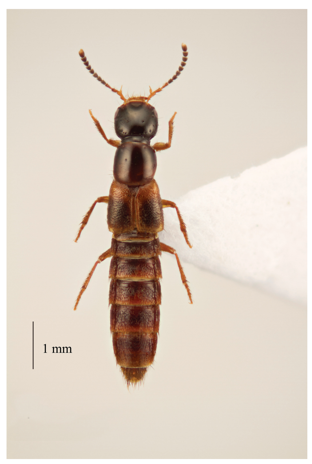
Figure 1. Habitus of Cheilocolpus kentiae (Lea, 1925).