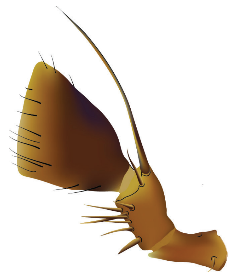
Figure 6. Labial palpi of Quediopsis howensis Jenkins Shaw & Solodovnikov, sp. n.

Antennomeres elongate, all of same colour. First antennomere slightly expanded apically, about as long as second and third combined.