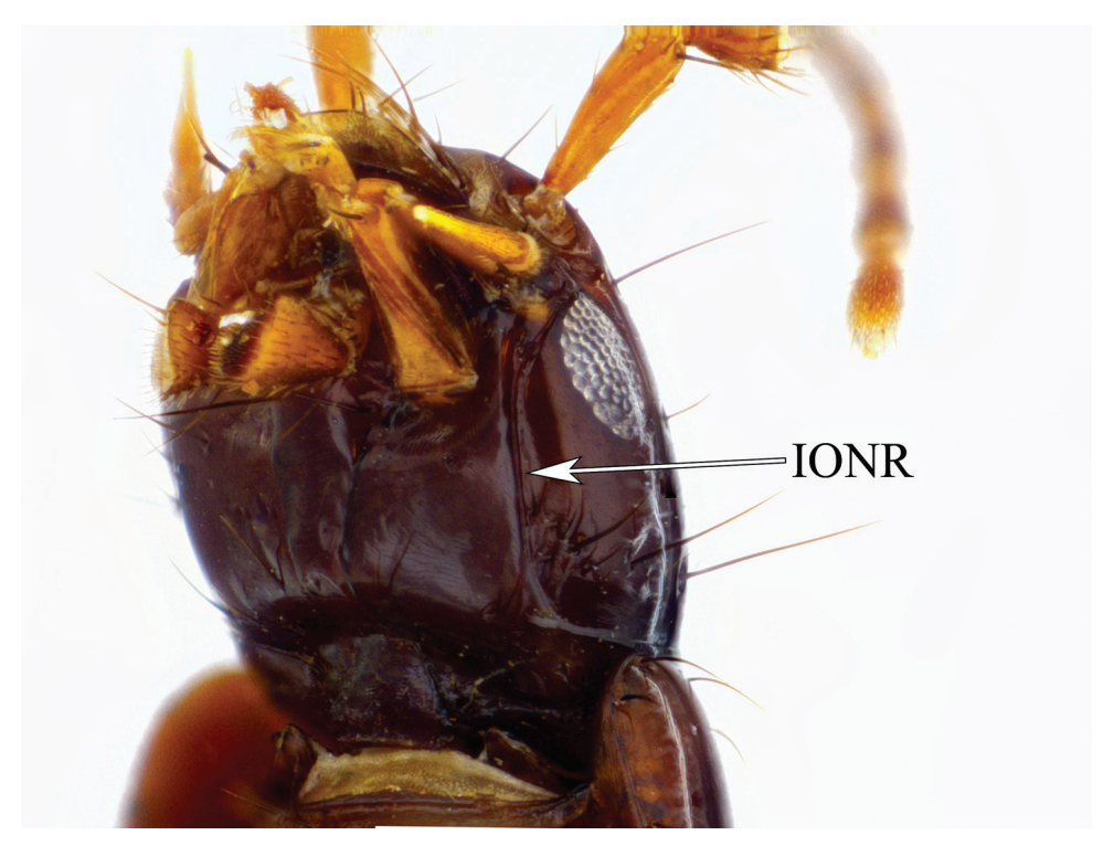
Figure 5. Lateroventral view of head of Quediopsis howensis Jenkins Shaw & Solodovnikov, sp. n. IONR = Infraorbital extension of nuchal ridge.

HOWE ISLAND, Goat House Track, 11 Nov 1979, G.B. Monteith / Q.M. BER-LESATE No. 138, Volcanic Soil, 250m, Pickard VegL Hb, Sieved litter'; 1 female, 'LORD HOWE ISLAND, Mt Gower summit (NE), 9 Nov 1979, G.B. Monteith / Q.M. BERLESATE No. 134, Volcanic Soil, 850m, Pickard Veg: GMF, Sieved litter'; 1 female, 'LORD HOWE ISLAND, Erskine Valley, north side, 22 Nov 1979, G.B. Monteith / Q.M. BERLSATE No. 160, Volcanic soil, 150m, Pickard Veg:CfLq, Sieved litter / VOUCHER SPECIMEN 81-40' (QM).