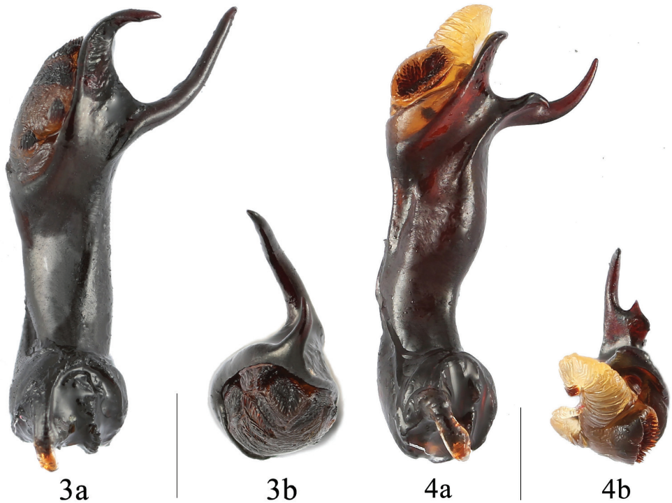
Figures 3–4. Aedeagi. 3 E. falcifasciatus sp. n. 4 E. qiujianyuei sp. n. Abbreviations: a lateral view b apical view. Scale bars 1 mm.

Etymology. This new species is dedicated to Ms. Jian-Yue Qiu, an insect researcher from Chongqing, who has been working on classification of insects for many years, collecting and providing many specimens of Endomychidae used in our studies.